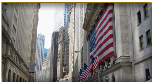
New York Stock Exchange

Country meetings are held with traditional and emerging great powers, states involved in military conflicts, and a broad sample of others drawn from all of the major world regions. UN organization meetings cover major issues such as peacekeeping missions, international terrorism, economic development, and environmental conservation.