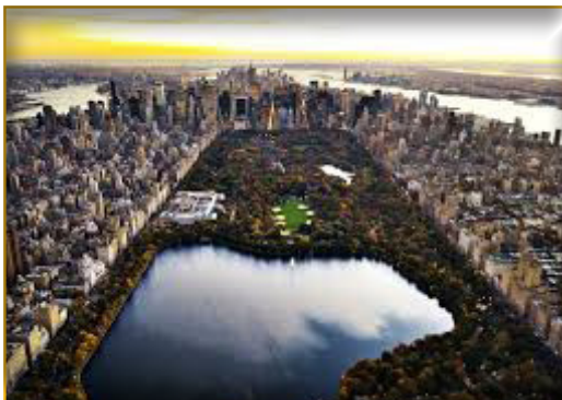
Aerial View of Central Park