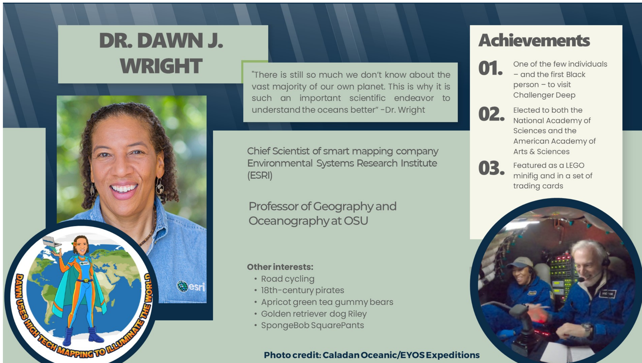
Figure 2. "Proof-of-concept" slide as a template for the Rockstars of Geology assignment created by Esther Jeninga, a Graphic Design major at UW-Whitewater who has not previously taken the Principles of Geology course. Slides like this will be used to introduce the assignment at frequent intervals during the semester as different course topics are covered in class.